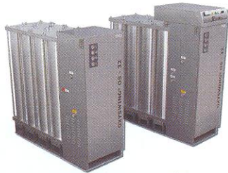
Innovative Gas Systems (IGS) is a major supplier of on-site air separation plants for the production of nitrogen and oxygen.